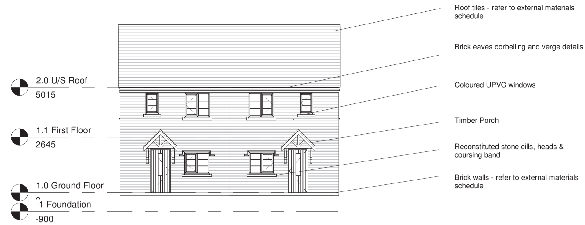
3 Front Elevation 1 : 100