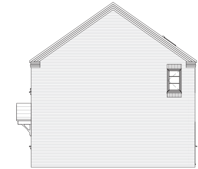
6 Side Elevation 2 1 : 100