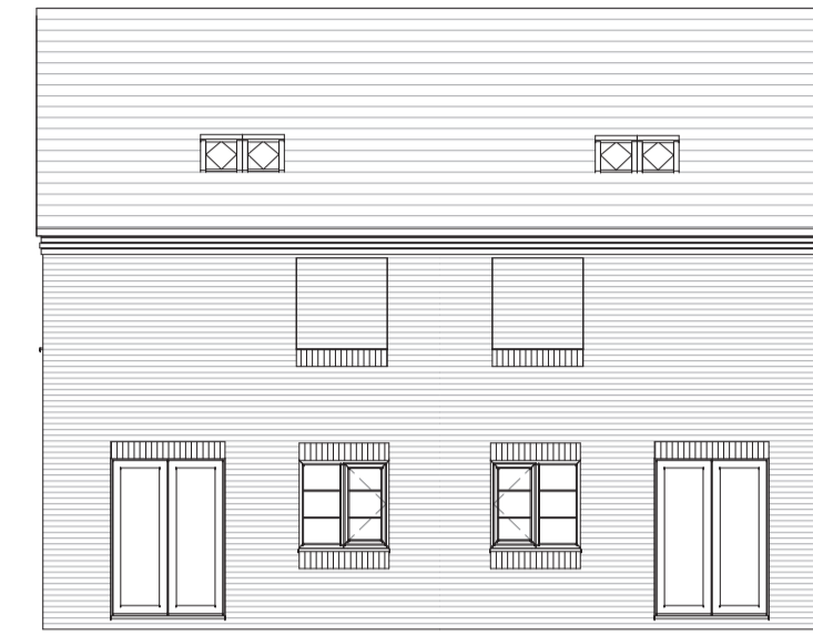
4 Rear Elevation 1 : 100