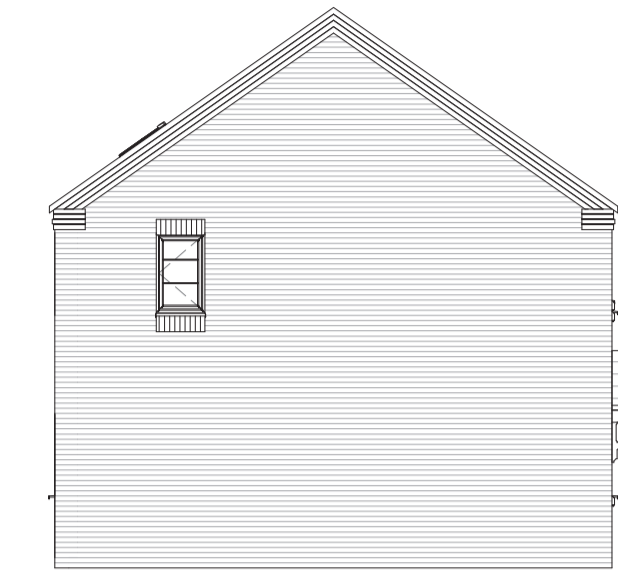
5 Side Elevation 1 : 100